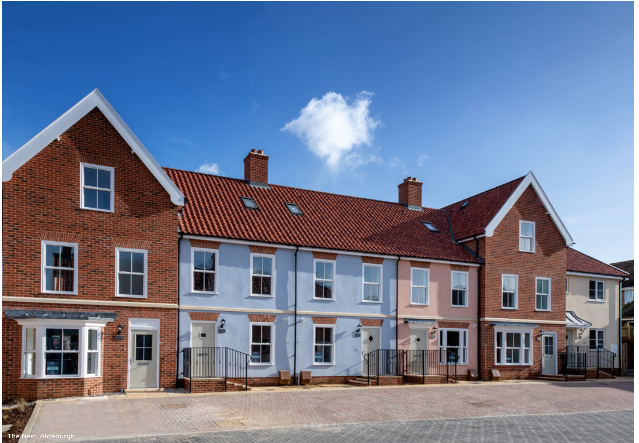
The Nest, Aldeburgh