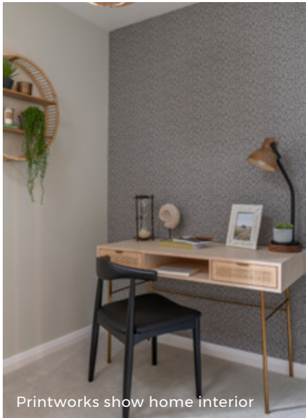
Printworks show home interior

And because we care for the environment, there's energy-efficient heating and attractive windows and doors that do a great job of keeping you warm in winter.