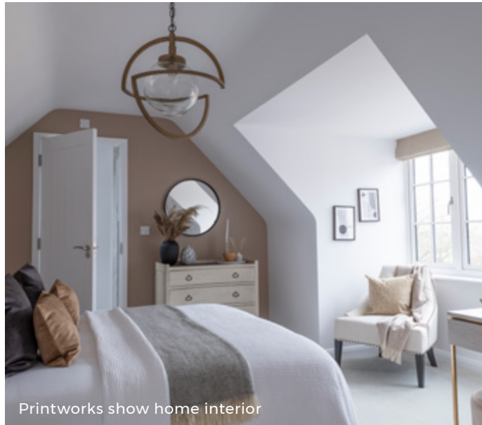
Printworks show home interior