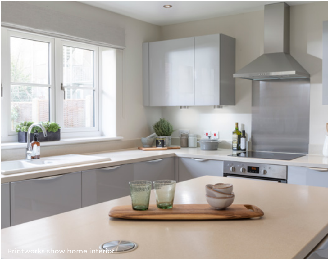
Printworks show home interior