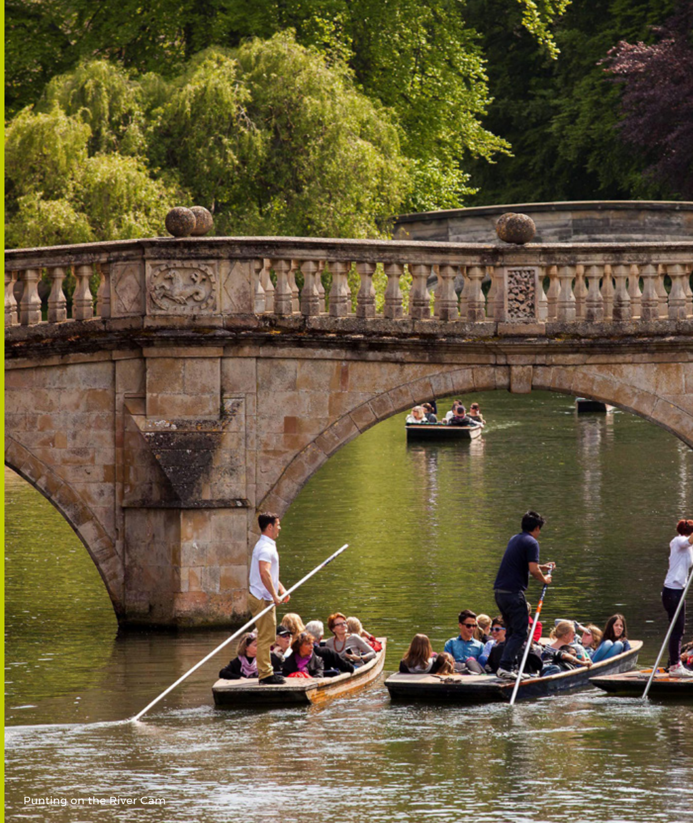
Punting on the River Cam

While enjoying the clear country air, however, you'll know you're only a short distance from thriving hubs like Cambridge, with all its shopping and cultural attractions.