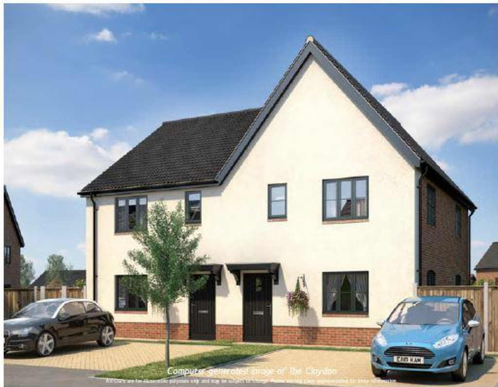
Computer generated image of The Claydon All cars are for illustrative purposes only and may be subject to change. Please see our Data Protection notice for more information.